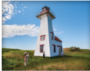
©TPEI016_SM_New London Bay